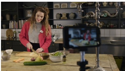
Record yourself with the Memory Mic...

The Memory Mic links up with the MEMORY MIC smartphone app (available free of charge from Google Play or Apple Store) via Bluetooth and works wirelessly at any distance from the smartphone to give you plenty of creative freedom in making your video. Then simply synchronise audio and video via the app at the touch of a button. The app additionally includes a mixing function which enables you to intuitively select a good mix between the sound of the Memory Mic and the ambient sound recorded by your smartphone.